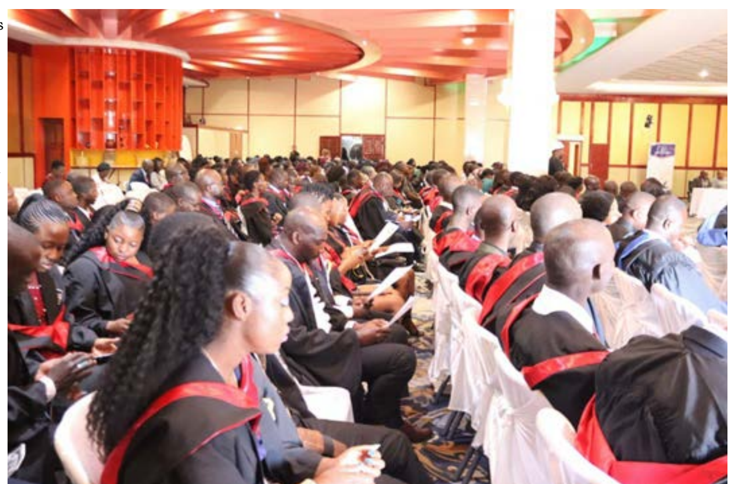
Congratulations to all our students who made it

Jraining...for <u>f</u>xcellence EduEpress