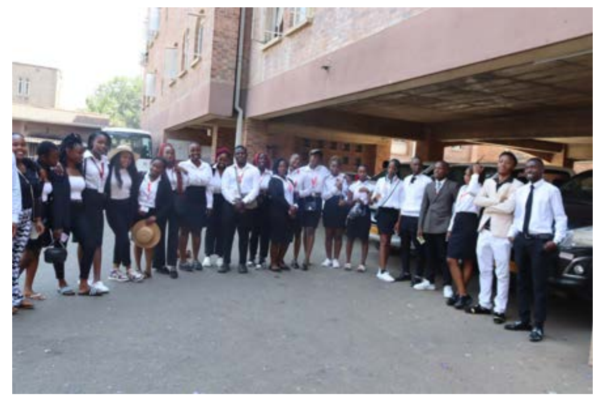
CTH students embarking on an educational tour