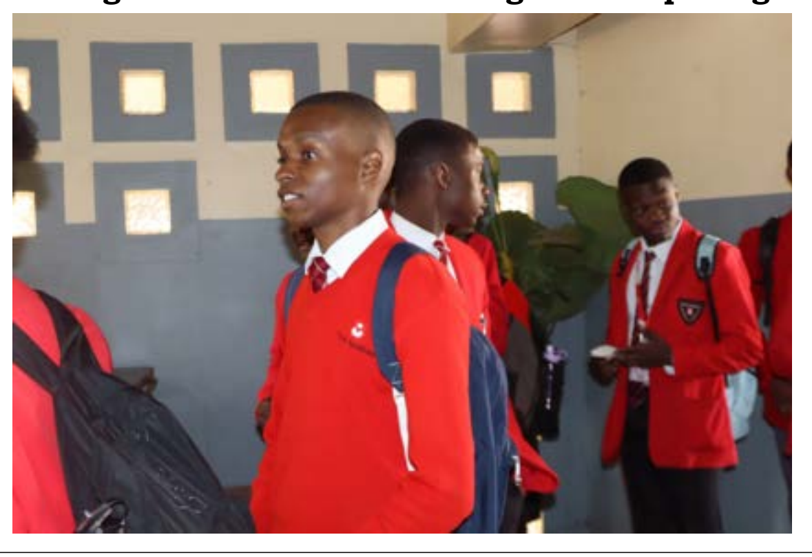
High school students coming on the opening day