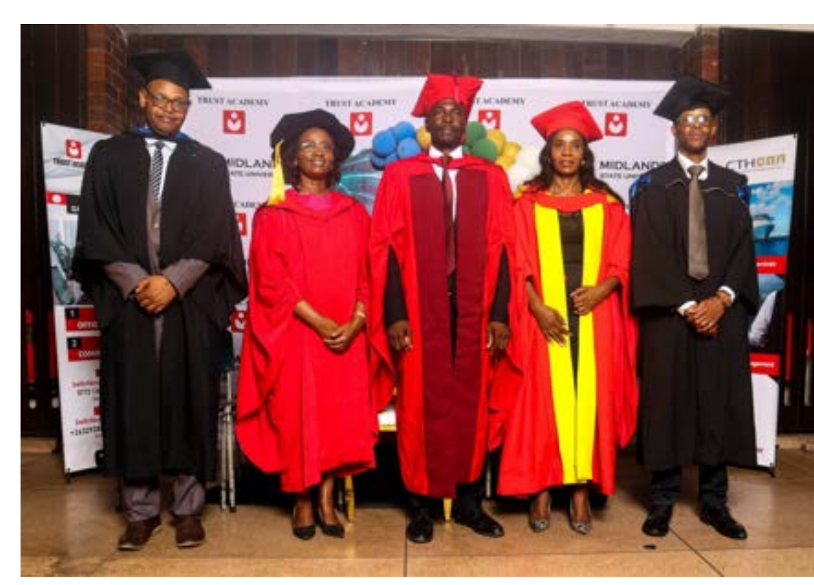
Trust Academy 4th graduation ceremony 2023